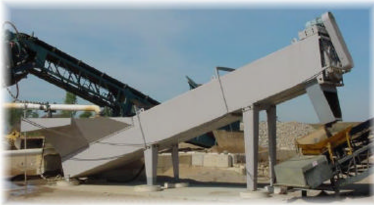
44" x 32' Fine Material Washer

These heavy duty fine material washers are ideally suited for removing material in applications such as fines recovery, sand manufacturing, concrete reclamation, salt reclamation, and municipal waste removal.